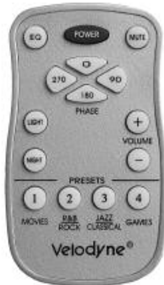
Figure 2. Remote Control

Figure 2 shows the remote control, enabling you to easily choose whatever listening mode you desire.